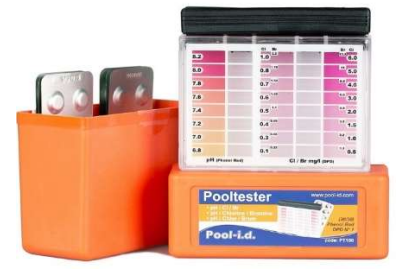
Figure 2. Pool water test kits