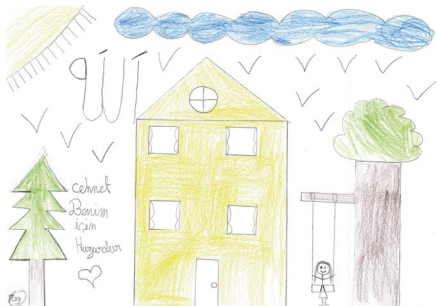
11-year-old girl / holy being (nonanthropomorphic) in heaven