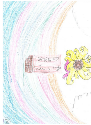
12-year-old girl / material blessings in heaven