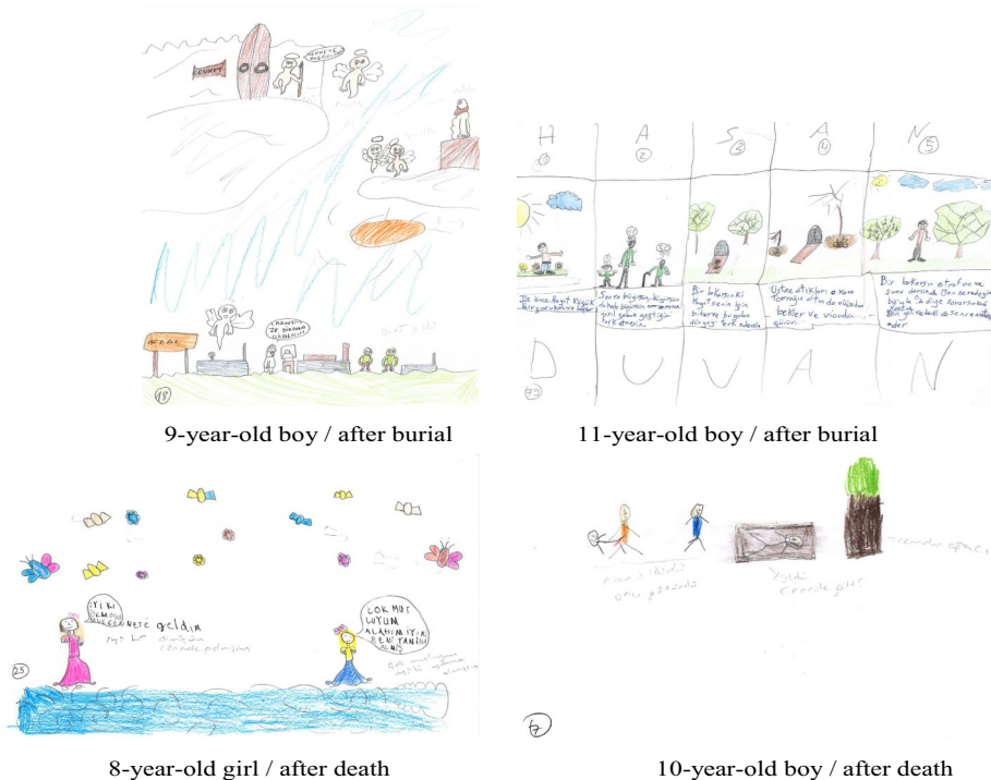
Fig. 1 Children’s drawings from the category heaven is a place people go after death

Spiritual and religious concepts of heaven. This category consists of six subcategories. See Fig. 2 for examples of drawings in this category. Sacred places and religious items in heaven: In these pictures, there were images of the Qur’an, mosques, the Kaaba, and prayer rugs from the Islamic religion. Spiritual blessings in heaven: In this category, some drawings depicted children with their families in paradise, mutual gift-giving, treating guests well, and other things that they imagined would happen in heaven. The children said that there would be spiritual feelings such as “happiness, serenity, affection, love, goodness, friendship and joy” in paradise. Girls’s drawings were assigned to this category more than boys’. As their age increased, spiritual blessings in heaven were a key feature in their answers. Holy beings in heaven: These children’s drawings described the concepts of Allah, the angel, and Prophet Muhammad depicted in a nonanthropomorphic way as all being present in heaven. As seen in Table 1, the 10–12 age group expressed this category more than the 9–10 age group. Symbols of heaven: This subcategory contained strictly symbolic depictions of heaven. These children described paradise with the themes of a waterfall and rainbow, a garden with an infinite variety of flowers, an apple tree, the