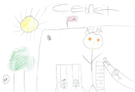
8-year-old girl / activities in heaven