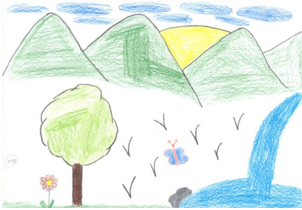
12-year-old boy / natural beauty in heaven