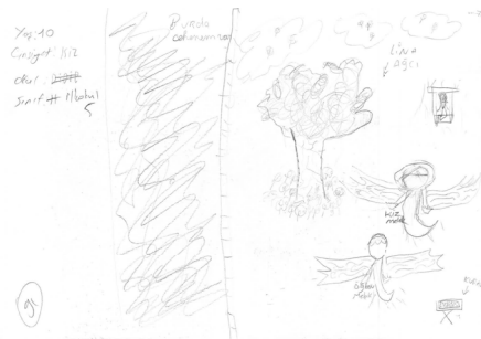
10-year-old girl / holy beings (anthropomorphic) in heaven