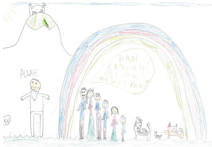
8-year-old girl / spiritual blessings in heaven