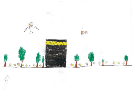
10-year-old boy / sacred places and religious items in heaven