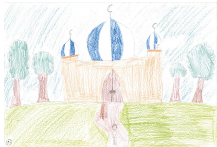
12-year-old boy / characteristics of people in heaven